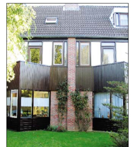
The Verkerks live in the left half of a duplex in Beek, in the southern part of the country.

Windmills: There are about 1,000 in the Netherlands. At one time, the country had as many as 10,000.